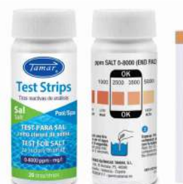
Salt Test Strips For salt chlorination pools - 20 tests