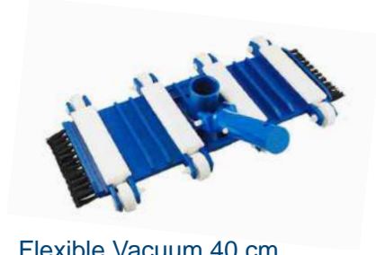
Flexible Vacuum 40 cm With Side Brushes