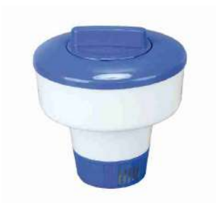
Floating Dispenser - Tablets 200g