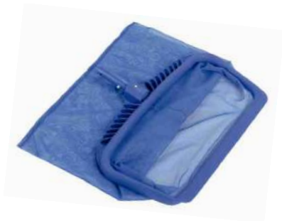
LUXE Leaf Rake