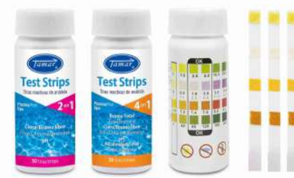
Test Strips Analysis test strips - 50 test

Test Strips 2 in 1 (free chlorine/bromine and pH).