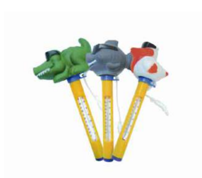
Floating Animals Thermometer