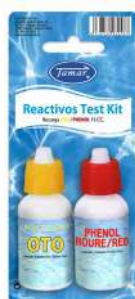
Refill from Basic Test Kit (PHENOL RED and OTO)