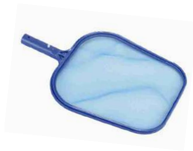
ECO Leaf Skimmer