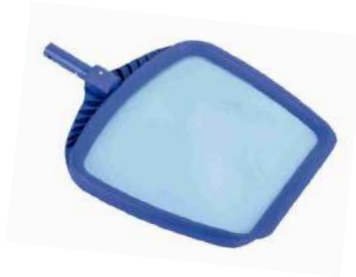
LUXE Leaf Skimmer