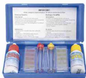
Basic Test Kit chlorine and pH