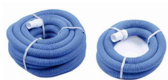
Vacuum Hose With different adapters