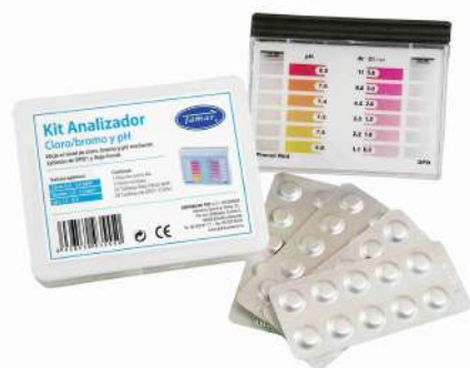
Test Kit DPD1 Tablets chlorine, bromine and pH