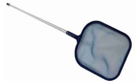
ECO Leaf Skimmer with Pole