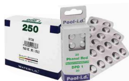
Refill from Test Kit DPD1