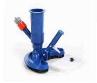
Ventury Vacuum Head 16 cm