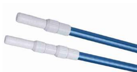
Telescopic Pole The pole has 2 sections.