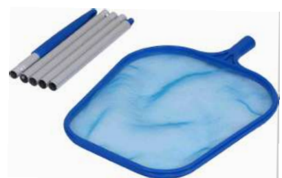
Leaf Skimmer detachable handle