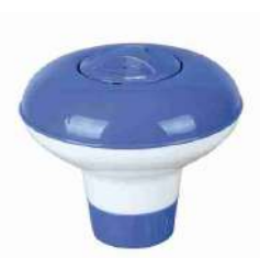
Floating Dispenser - Tablets 20g