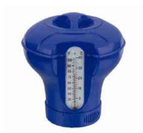
Floating Dispenser With Thermometer - Tablets 200g