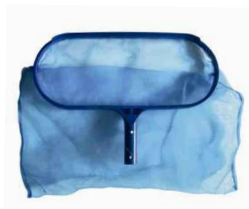
ECO Leaf Rake