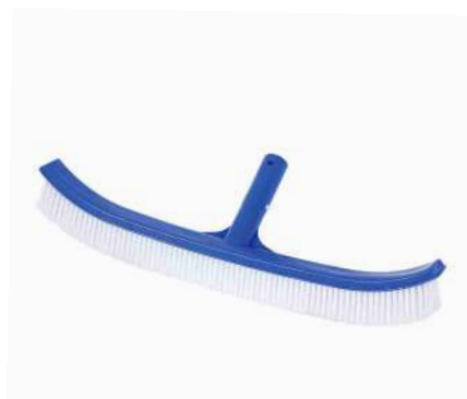
Curved Brush 45 cm