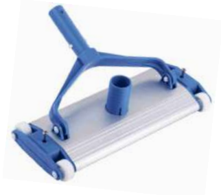
Aluminum Vacuum Head 36 cm